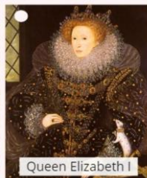
Queen Elizabeth I

This mighty ruler 1)_____ of the world on his shoulders at an early age when his mother claimed he was the son of Zeus, destined to completely reconstitute the world order. He was able to 2)_____ this path since his father equipped him with the most dangerous standing army. His unwavering commitment to his heroic narrative sent him on a crash course to turning a humble state into the largest and most influential empires and becoming one of the greatest leaders in history through passion and military 3)_____.