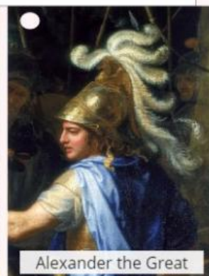
Alexander the Great