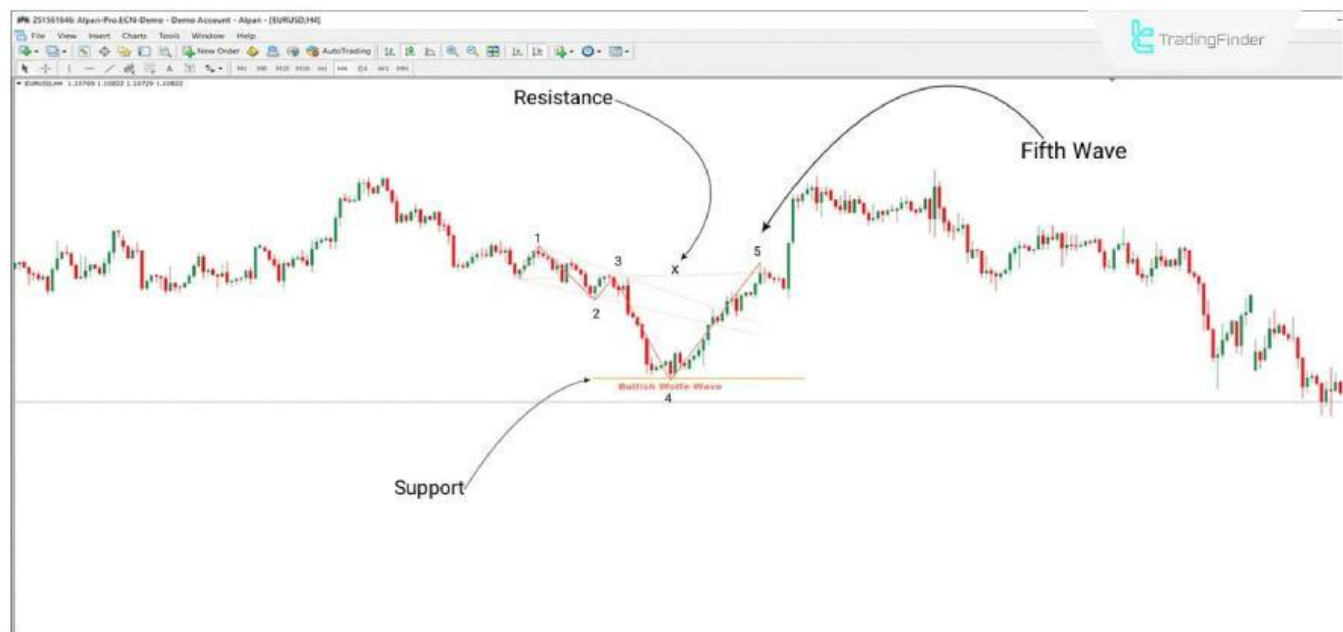
Wolfe Wave Pattern in an Uptrend

The price chart of the EUR/USD currency pair in a one-hour time frame shows how the indicator works in an uptrend. As shown in the image, the indicator draws the Wolfe Wave Pattern by forming five waves [1-2-3-4-5]. The completion of the fifth wave and the break of the "X" line by the trend indicates a continuation of the uptrend and a suitable opportunity to enter a Buy position.