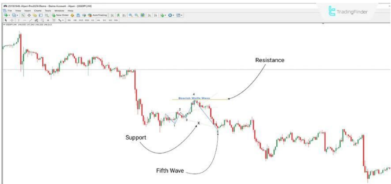
Wolfe Wave Pattern in a Downtrend

The price chart of the USD/JPY currency pair in a 4-hour time frame shows how the indicator works in a downtrend. The image shows that the indicator draws the Wolfe Wave Pattern by forming five waves [1-2-3-4-5]. The completion of the fifth wave and the break of the " X " line by the trend indicates a continuation of the downtrend and a suitable opportunity to enter a Sell position.