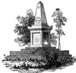
2. M _ _ _ _