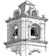
4. B _ _ _ _