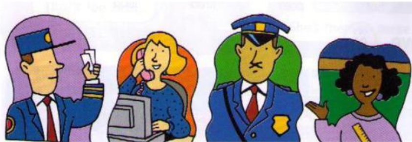
A train conductor