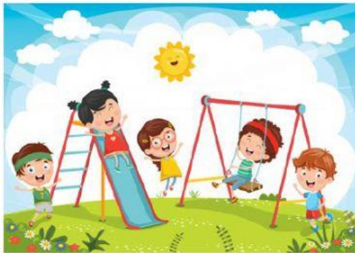
5- Playing safely