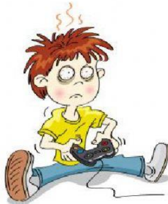
4- Playing video games at a near distance