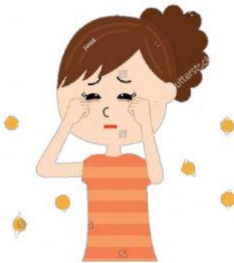
3- Not avoiding dust and smoke