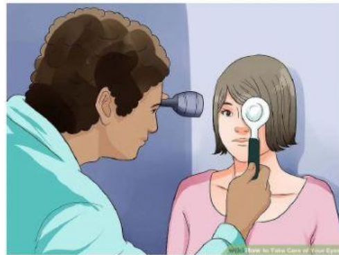
6- Visiting a doctor