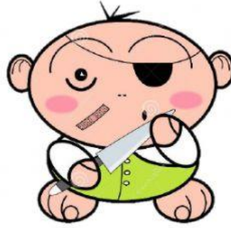
2- Playing with sharp things