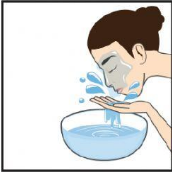
1- Washing our eyes