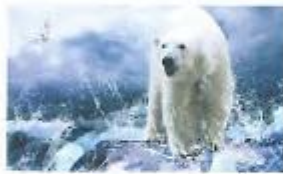
1 polar bear

eagle fox gorilla leopard lizard panda penguin polar bear rhino turtle