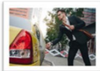
take a taxi / cab