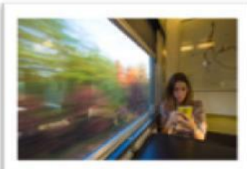
take the train