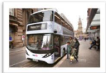
take the bus