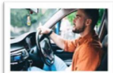
drive a car