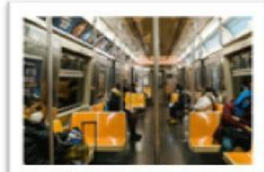
take the subway