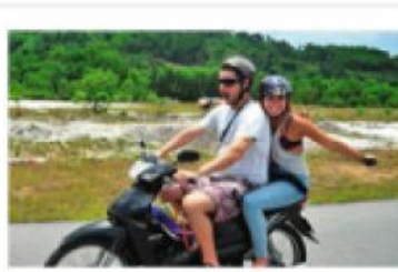
ride a motorcycle