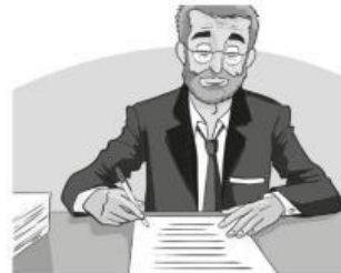
7 mathematician / writer