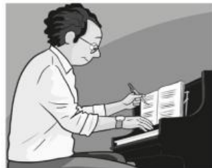
6 composer / writer