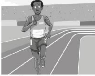
1 athlete / surgeon

1 Look at the pictures and circle the correct options.