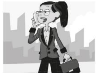
8 businesswoman / athlete

2 Put the letters in bold in the correct order to make words for qualities.