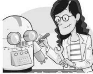
2 inventor / composer