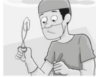
3 surgeon / writer