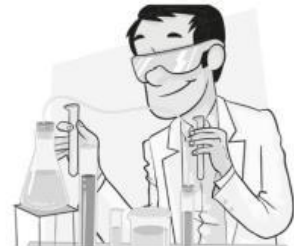
5 athlete / scientist