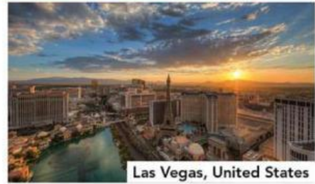
Las Vegas, United States