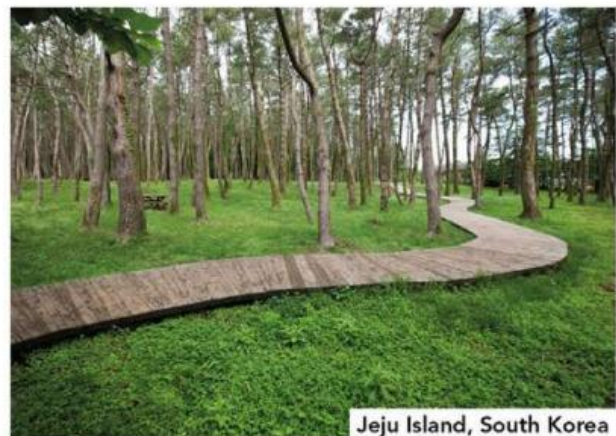
Jeju Island, South Korea