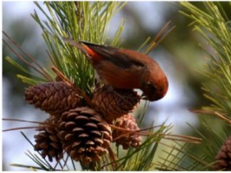
This Photo by Helmut von Ardenne is licensed under