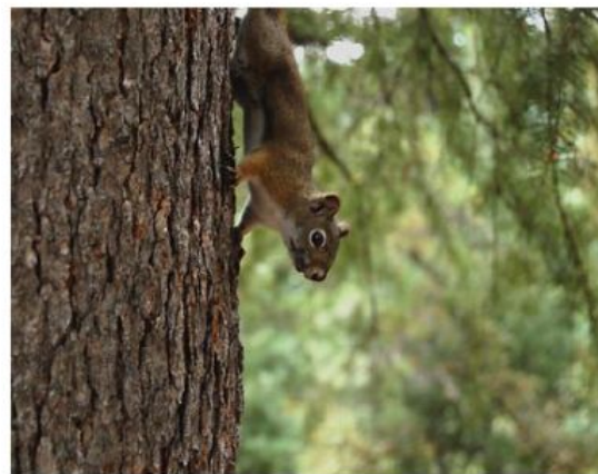
This Photo by Helmut von Ardenne is licensed under