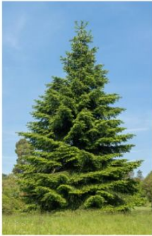
A fir tree. Douglas Firs make great Christmas trees, too!