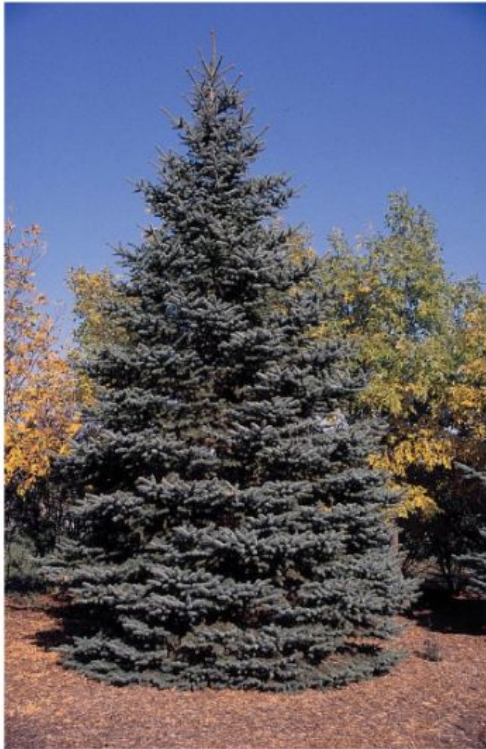
This is a Spruce. Great for Christmas trees.