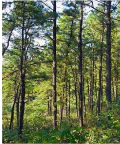
Pine trees in the forest