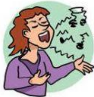
sing / well