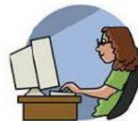
use / computer