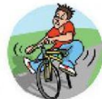
ride / bike