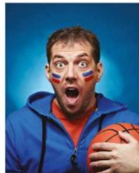
a sports nut