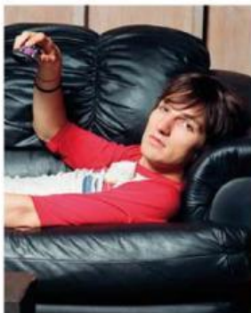
a couch potato

Listen to Rachel, Nicholas, Zack, and Jennifer discuss sports and exercise. Who is a couch potato? a fitness freak? a sports nut? a gym rat?