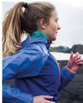
a fitness freak