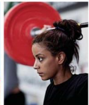
a gym rat