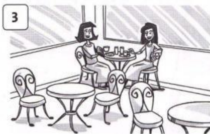
c af é