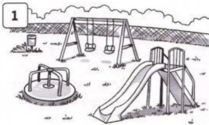
pla y gr ou nd