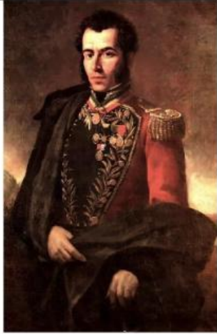
Antonio José de Sucre