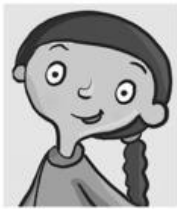
1 Amy ____

7 7 Listen. What is each person planning to take? Write the letter.