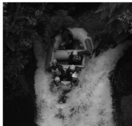
2 A B C D