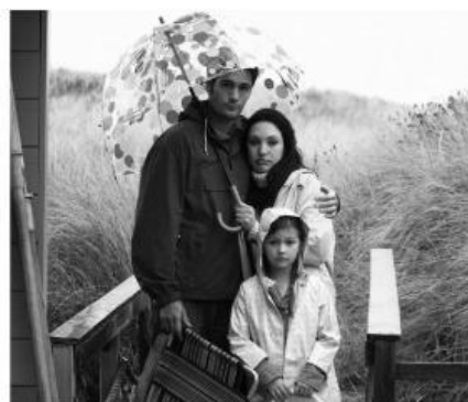
4 A B C D

B ▶1.14 Listen to the statement or question. Choose the letter of the correct response.