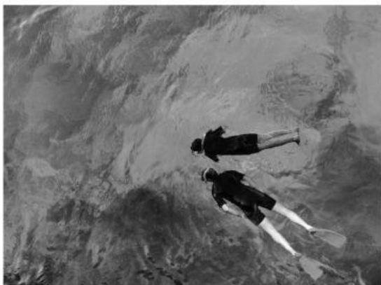
1 A B C D

A ▶1.13 Listen to each statement. Choose the one that goes with the picture.