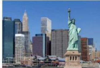
visit The Statue of Liberty