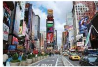
visit Times Square