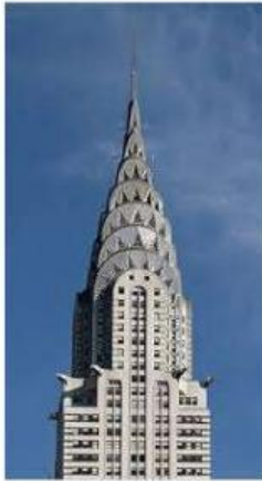
see the Chrysler Building