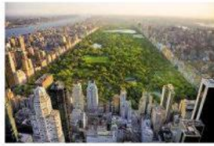
visit Central Park