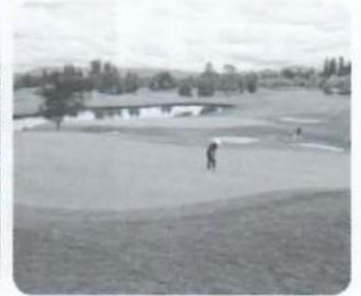
4 golf _____