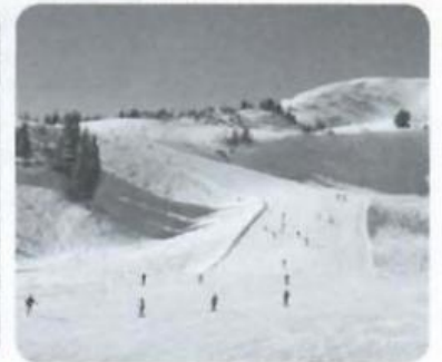
6 ski _____