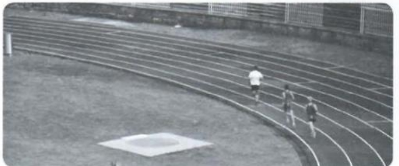
7 athletics _____