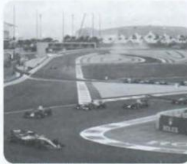
3 Formula 1 _____