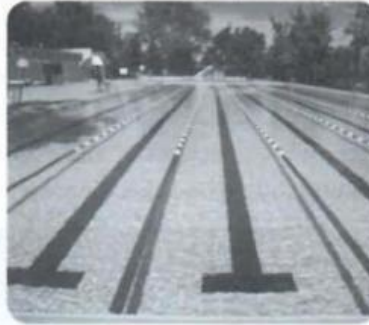
1 swimming pool _____

circuit course court pitch pool slope track