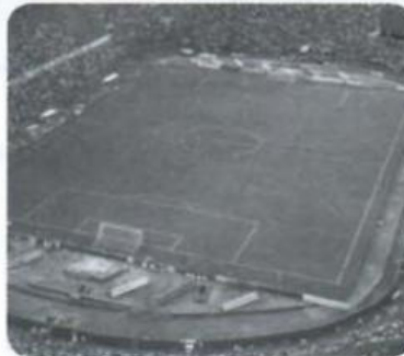
5 football _____