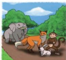
Picture 2.5. An elephant and his friends

The elephant was upset and felt heartbroken.