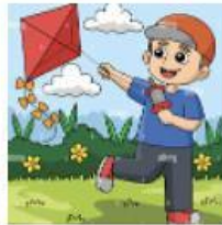
fly a kite