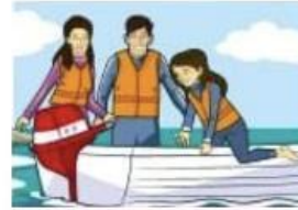
go on a boat