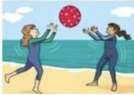
play with a ball