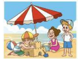
build a sandcastle