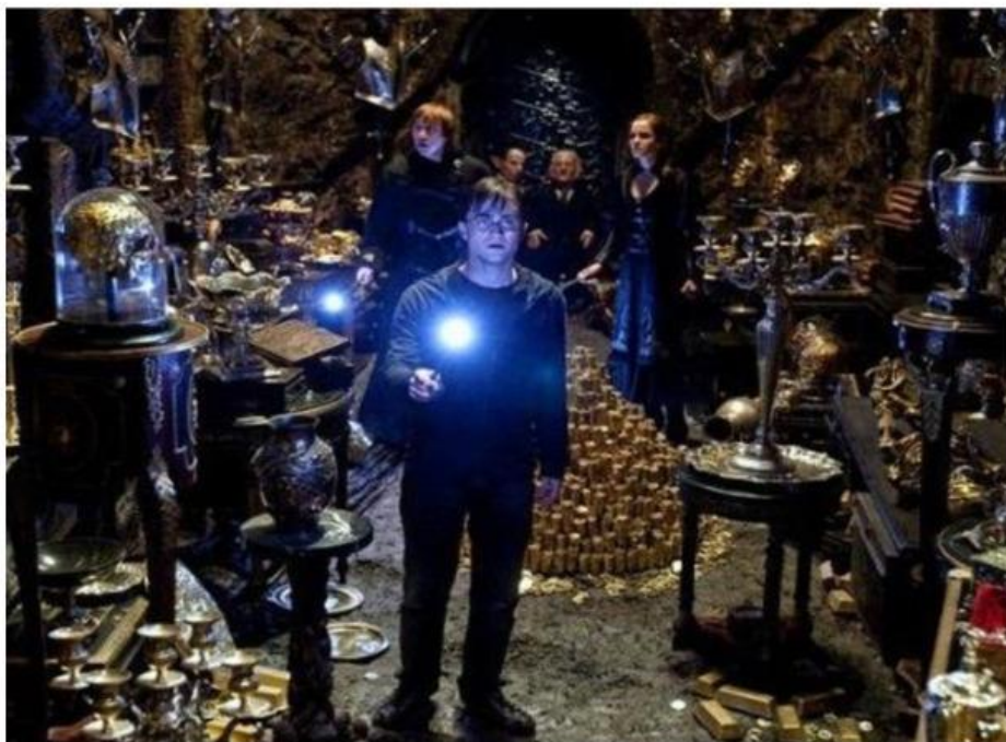
Madame Lestrange's vault

5. The last time Harry and his friends ate Bertie Bott's beans was 5 years ago. They haven't