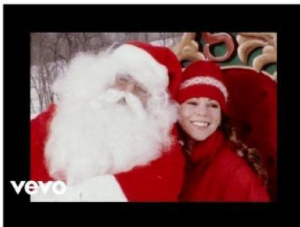
Mariah Carey - All I Want For Christmas Is You | Vídeo Musical, Letra de la Canción y Karaoke

Aprende Inglés de una forma divertida con el vídeo musical y la letra de la canción "All I Want For Christmas Is You" de Mariah Carey