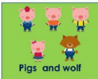
Pigs and wolf