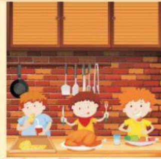
At the Restaurant