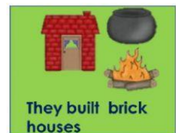
They built brick houses