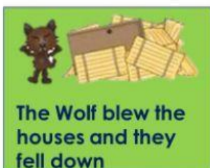
The Wolf blew the houses and they fell down