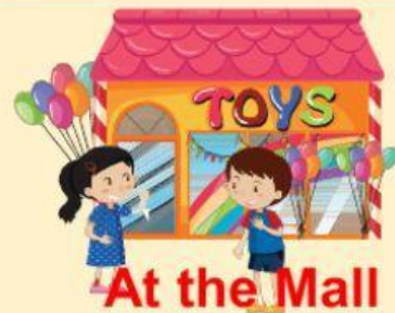
At the Mall