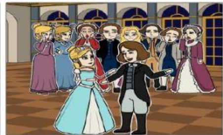
The second night of the ball, Cinderella is transformed again and makes it back just in time.

6- What's the title of the fantasy story?