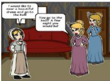
Cinderella's sisters are invited to the ball but she is not.