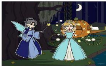
Cinderella meets her fairy godmother and is transformed for the first time. She leaves the ball before the magic wears off.