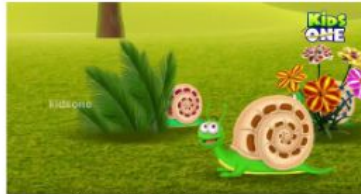
The Snails hide.