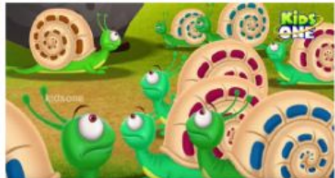
The Snails meet to make a plan.