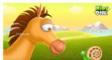
The proud horse asks the snail to race him.