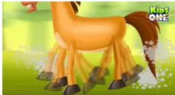
The Horse runs as fast as It can.