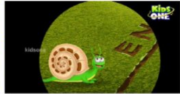
The snails trick the Horse and win the race.