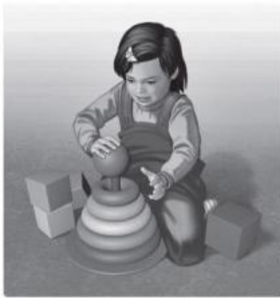
1 She's a _____.

centenarian elderly infant in his / her teens in his / her twenties middle-aged toddler young child