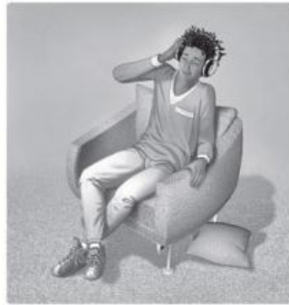
2 He's _____.