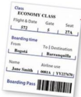
⑥ a boarding pass