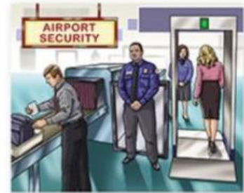
⑤ go through security