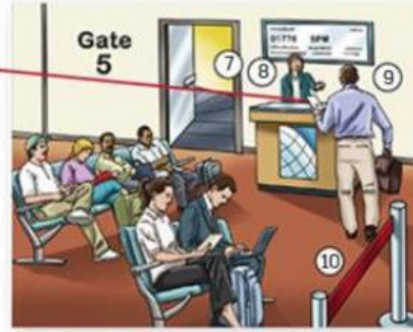
⑦ the gate