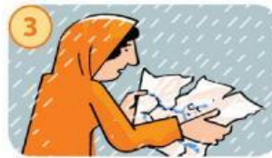
couldn't read / map