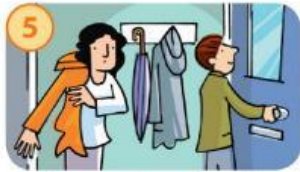
forget / umbrella