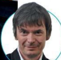
IAN RANKIN Scottish writer (1960–)