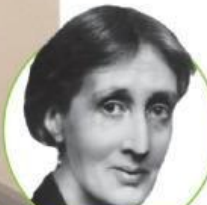
VIRGINIA WOOLF English writer (1882–1941)