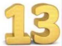
the number 13

2 A Were these people lucky or unlucky? Match the verbs in bold with the meanings.