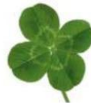
a four-leaf clover