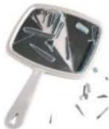
a broken mirror