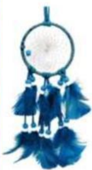
a dream catcher

1 Do you think these things bring good or bad luck? Can you think of more examples?