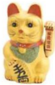
a fortune cat