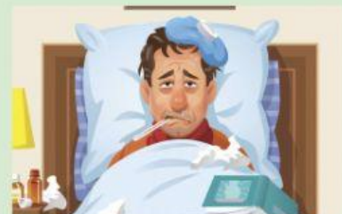
Some bacteria enter living things and give them illnesses