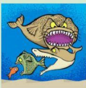
Big fish eat little fish