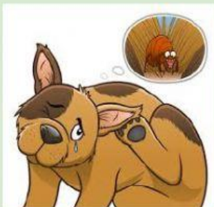
Fleas live by drinking the blood of dogs and other animals