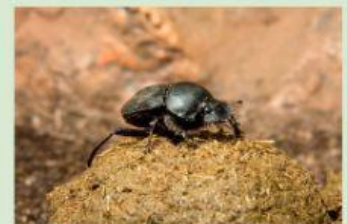
The dung beetle eats elephant excrement