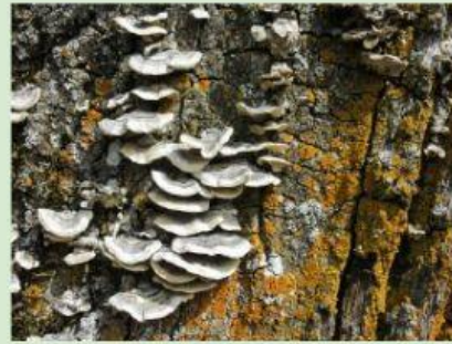
This fungi takes nutrients from the tree and damages the tree