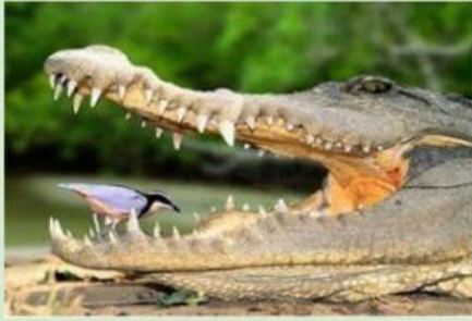
This little bird is feeding on the pieces of food in the crocodile's teeth