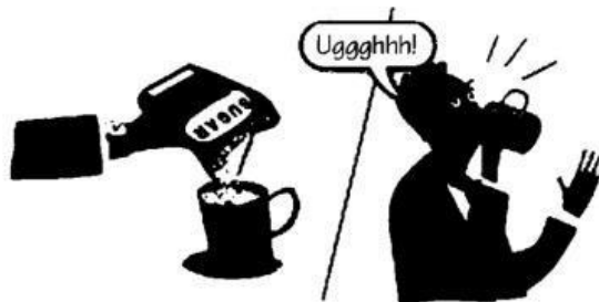
There is too much sugar in it.