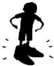
His shoes are too big for him.