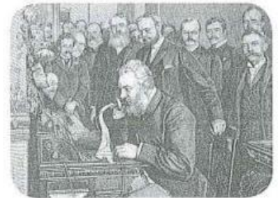
▲ Alexander Graham Bell