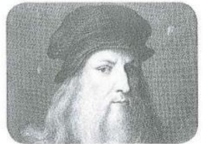
▲ Leonardo da Vinci