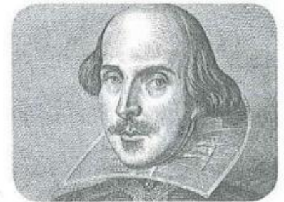
▲ William Shakespeare