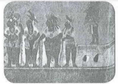
▲ the Maya