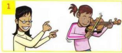
I have a music lesson.