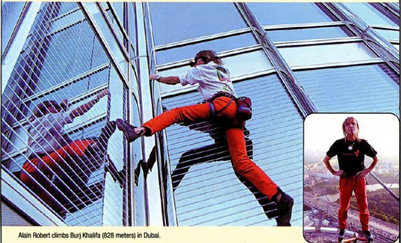
Alain Robert climbs Burj Khalifa (828 meters) in Dubai.

As a child, Alain Robert was afraid of heights. One day, when he was 12, he returned home from school. At the front door of his building, he looked for his keys. He didn't have them. It was 3:30, and his parents worked until 6:00 p.m. Robert looked at his apartment on the eighth floor. He saw an open window. He closed his eyes and 5 pictured himself climbing the building. When he opened his eyes, he told himself, "I can do it." Fifteen minutes later, he was in his house, and his fear of heights was gone.