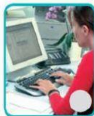
use a computer