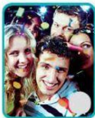
have a party