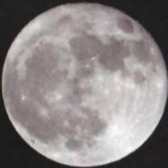
A Full Moon