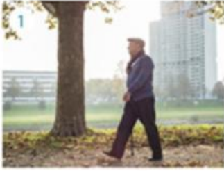
_____ for a walk

A Look at the pictures. What is the same about all these activities?