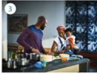
_____ a meal