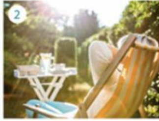
_____ in the backyard