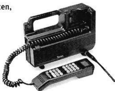
One of the first mobile phones