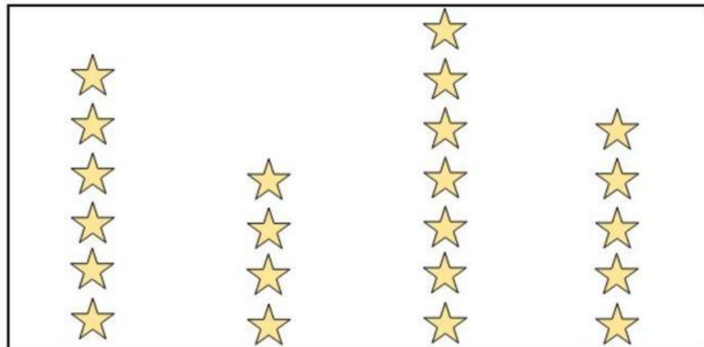
Numbers of votes

Look at the pictograph and answer the questions in the boxes below.