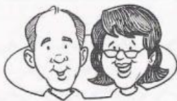
my grandparents (have)

4. How long _____ math? _____ for _____.