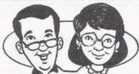
my parents (live)

8. How long _____ at the mall? _____ for _____.