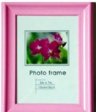
Plastic photo frame