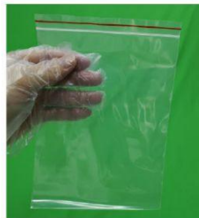
Clear plastic bag

There are different types of plastic. They have different properties