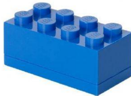
Plastic toy block