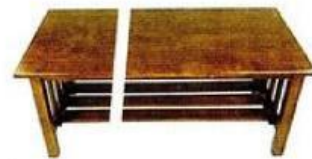
a coffee table