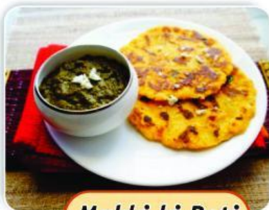
Makki ki Roti