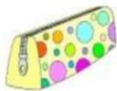
pencil case / pencil