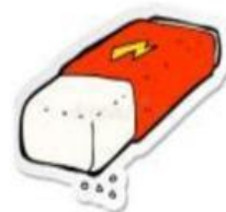
bag / eraser