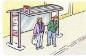
a bus stop