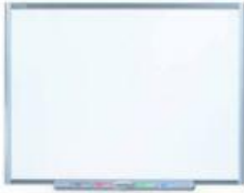
1. a board