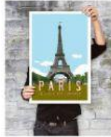
2. some posters