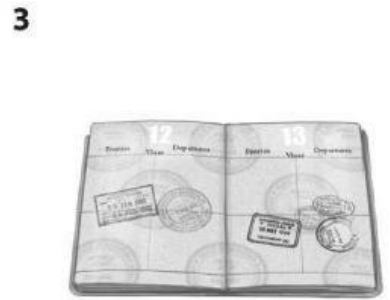
Don't forget your _____!