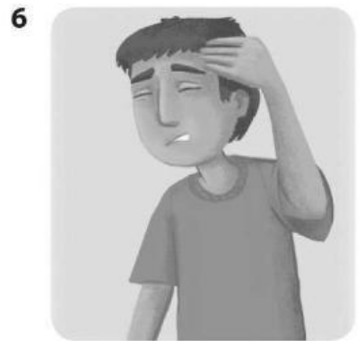
Now Harry has a(n) _____.