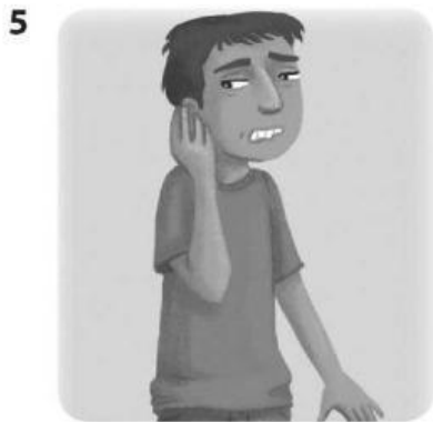
Harry has a(n) _____.