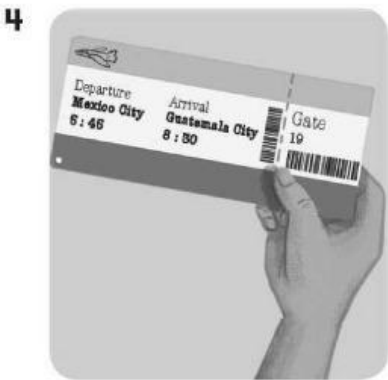
Guatemala City is your _____.