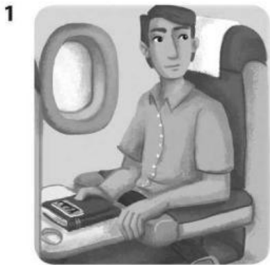
Mr. Lewis is a(n) _____.

earache passenger destination headache passport airport