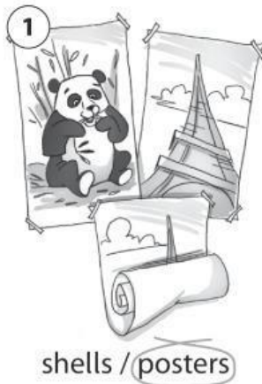
shells / posters