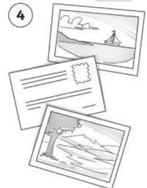
postcards / posters