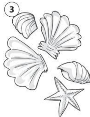
badges / shells