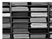
checkout / shelves

3 Choose the correct words to label the pictures.