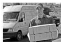
4 deliver / exchange