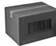
1 bar code / shop assistant