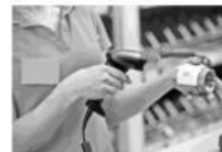
3 fit / scan