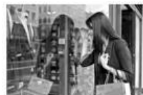
2 changing room / window-shopping