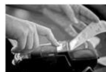
5 label / receipt

4 Complete the blog with the words in the box.